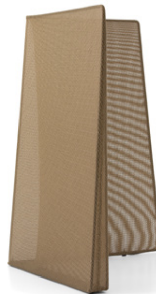
Bumble Bee (T624)