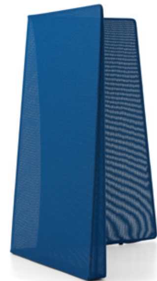
Marina Blue (T625)