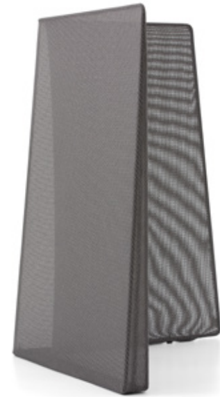
Sultry Smoke (T615)